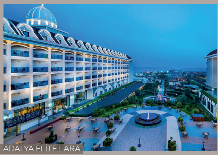
ADALYA ELITE LARA